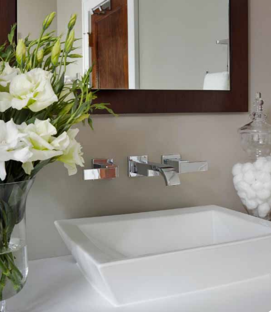
OPPOSITE: The custom flat-panel walnut vanity, wrapped with durable solid-surfacing in a waterfall effect, was designed with doors that look like drawers. “We wanted it to look more like a dresser than a cabinet,” designer Lesly Sallan says. Behind the mirror is a built-in medicine chest. LEFT: The roomy vessel sink works with contemporary wall-mount hardware in polished chrome.